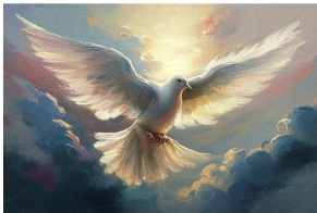
Catholic Charismatic Renewal

Leadership Day - Archdiocese of Philadelphia Catholic Charismatic Renewal on Saturday, November 9 from 9:00 AM to 3:30 PM at Epiphany of Our Lord Church, Plymouth Meeting. Speakers: