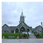
St. Teresa of Calcutta