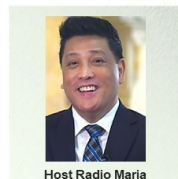
Host Radio Maria