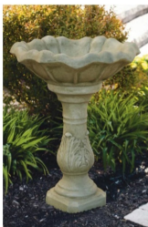
Scroll Bird Bath With Tulip Top 26.5" H

Thank you to everyone for collecting the Redner's Register Tapes for our Parish. Money we receive from this program goes toward our Parish Religion Education Program (PREP). Containers for the register tapes are in the vestibule of church.